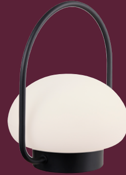
Example: A battery powered luminaire with integrated LED.