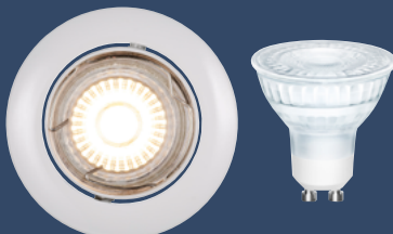
An example is a lamp with an included retro fit bulb, such as Recess with GU10 and Works with G13 . The included bulb must meet the requirements of a type 1 light source.

3 A containing product where the light source can be taken out and replaced using regular tools.