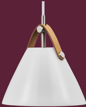
Example: A traditional retro fit luminaire sold without a bulb.