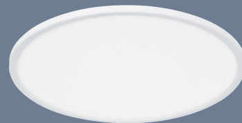
Examples are lamps with integrated LED where the LED module is not easily accessible, such as Oja , Oakland and Clarkson . The entire lamp is considered as and must meet the requirements of a type 1 light source.

2 A containing product that you cannot disassemble for control measurement of the light source without the risk of damaging the light source.