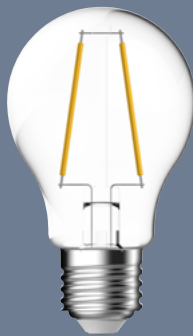
Example: A traditional retro fit bulb.

1 A light source with or without a controlling device.