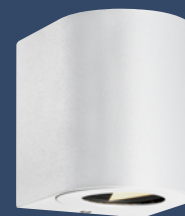
Typically, these products are lamps with integrated LED where the light source can be taken out without the risk of damaging it, e.g., removing the shade. Examples are products such as Canto and Grip where the light source is easily accessible, but also products such as Artist where you might risk breaking the shade, but the light source remains undamaged. The integrated light source must meet the requirements of a type 1 light source.

4 A containing product where the light source cannot be replaced, but it can be taken out for control measurement.